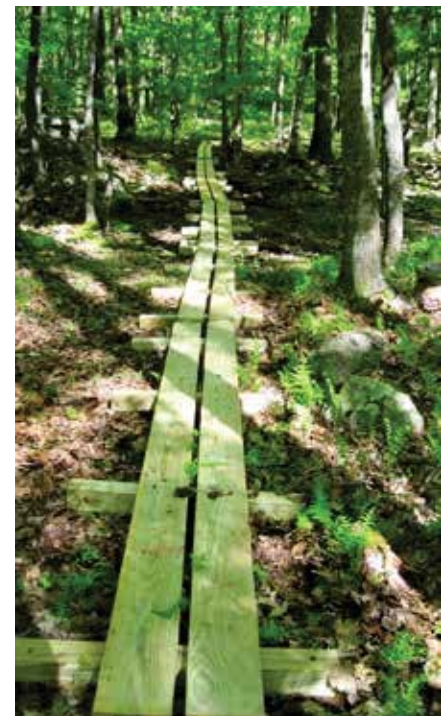
A bog bridge constructed by volunteers in Tillinghast Pond Preserve.

Working alongside TNC and AMC volunteers were the Coventry Boy Scouts, students from The Greene School (environmental charter high school), and corporate volunteers from Schneider Electric. A spur trail further connects both properties to the Pratt Conservation Area, protected by the West Greenwich Land Trust.