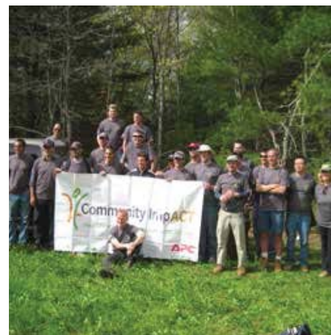
Proud volunteers from Schneider Electric, working on the Tillinghast Pond Management Area Trail.

Advise fledgling trail committee members on sustainable trail routing and construction techniques, signage, public engagement, volunteer work events, and celebrations.