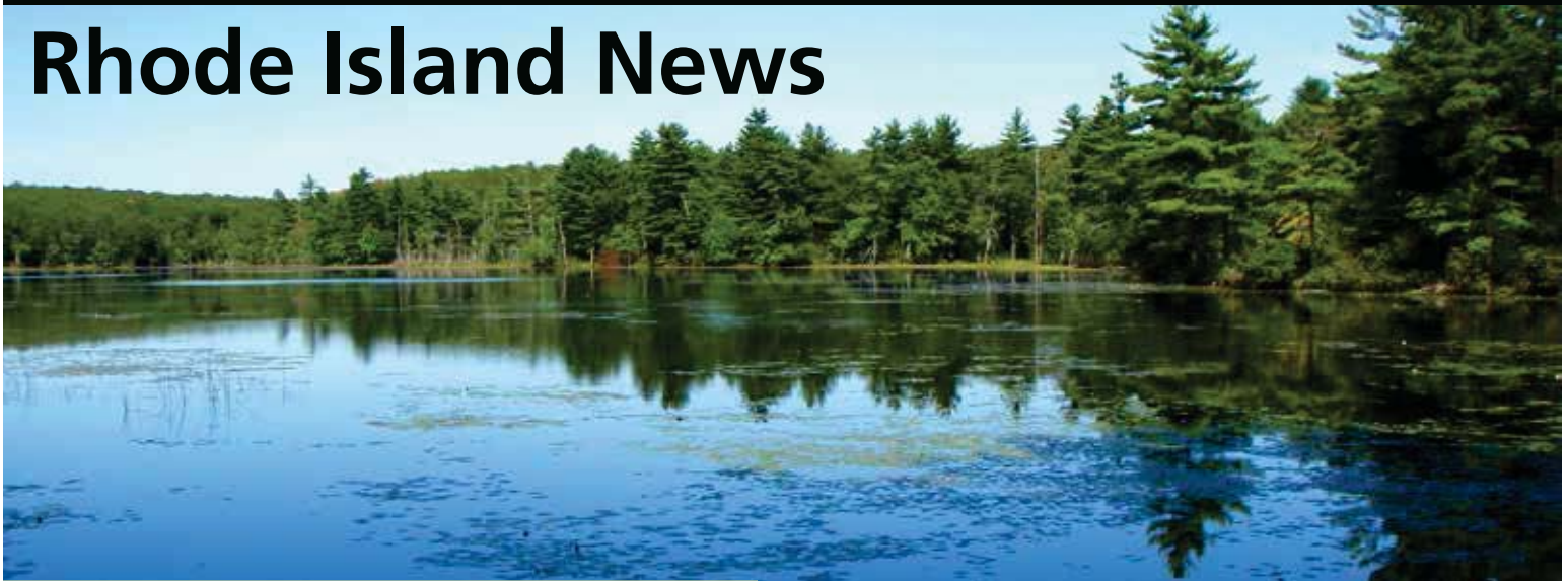
Tillinghast Pond Preserve in West Greenwich, Rhode Island.